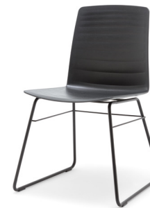
STU-KU Chair with skid