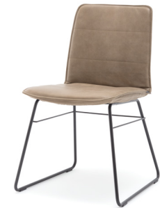
STU-KU with fitted cover Chair with skid and fitted cover