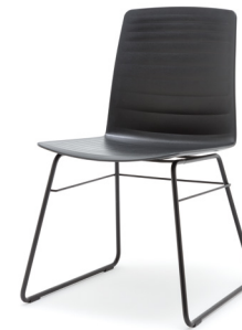
STU-KU Chair with skid