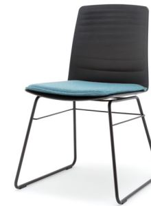
STU-KU with SIK Chair with seat cushion