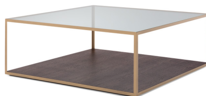
Coffee table: 110 x 110 cm Height: 40 cm Table top 1: Clear glass Table top 2: Oak brown stained Frame: RAL 1036 Pearl gold