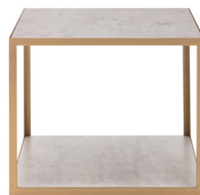
Coffee table: 50 x 50 cm Height: 50 cm Table top: Cement look Frame: RAL 1036 Pearl gold