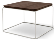
Coffee table: 61 x 61 cm Table top: Oak brown stained Frame: RAL 7047 Telegrey 4