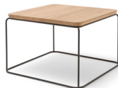
Coffee table: 61 x 61 cm Table top: Oak natural Frame: RAL 9005 Jet black